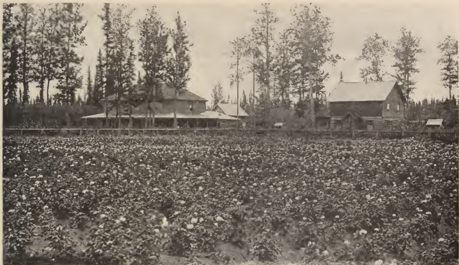
THE VEGETABLE GARDEN, SAINT MARK'S MISSION, NENANA, ALASKA

THE vegetable garden at Saint Mark's, Nenana, Alaska, has flourished this season as will be seen by the above picture. In the mission field—especially where there are many children to feed—the garden is an absolute necessity and every bit of available space is used. Tortella Hall is the building to the left, Saint Mark's Hospital is at the right, and the large cache and general storehouse is in the center of the picture and stands behind the two other buildings.